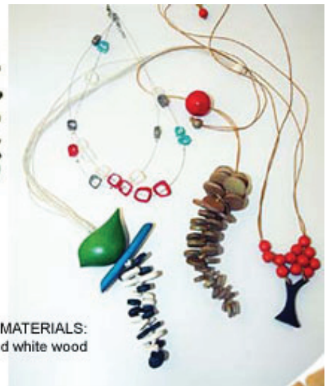
MATERIALS: Dyed white wood